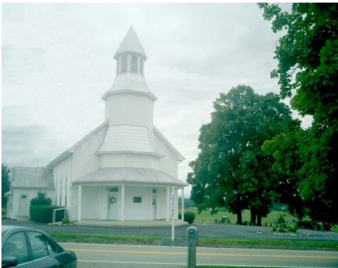
Fairview Methodist Church, Jonesborough, TN

A photo of the church, taken about 2002, is shown below. The cemetery is visible to the right of the church.